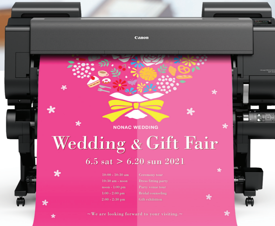
with fluorescent ink