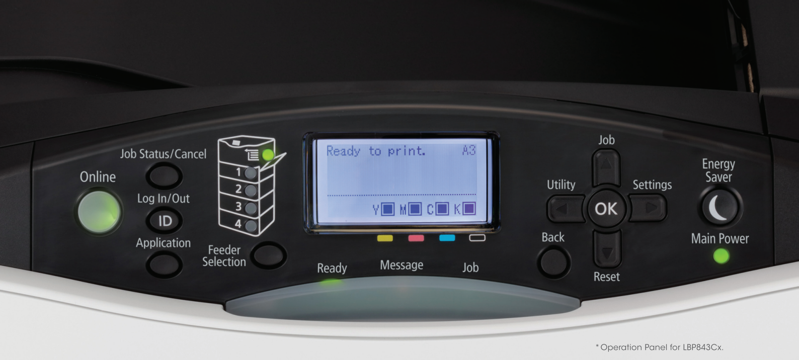
* Operation Panel for LBP843Cx.